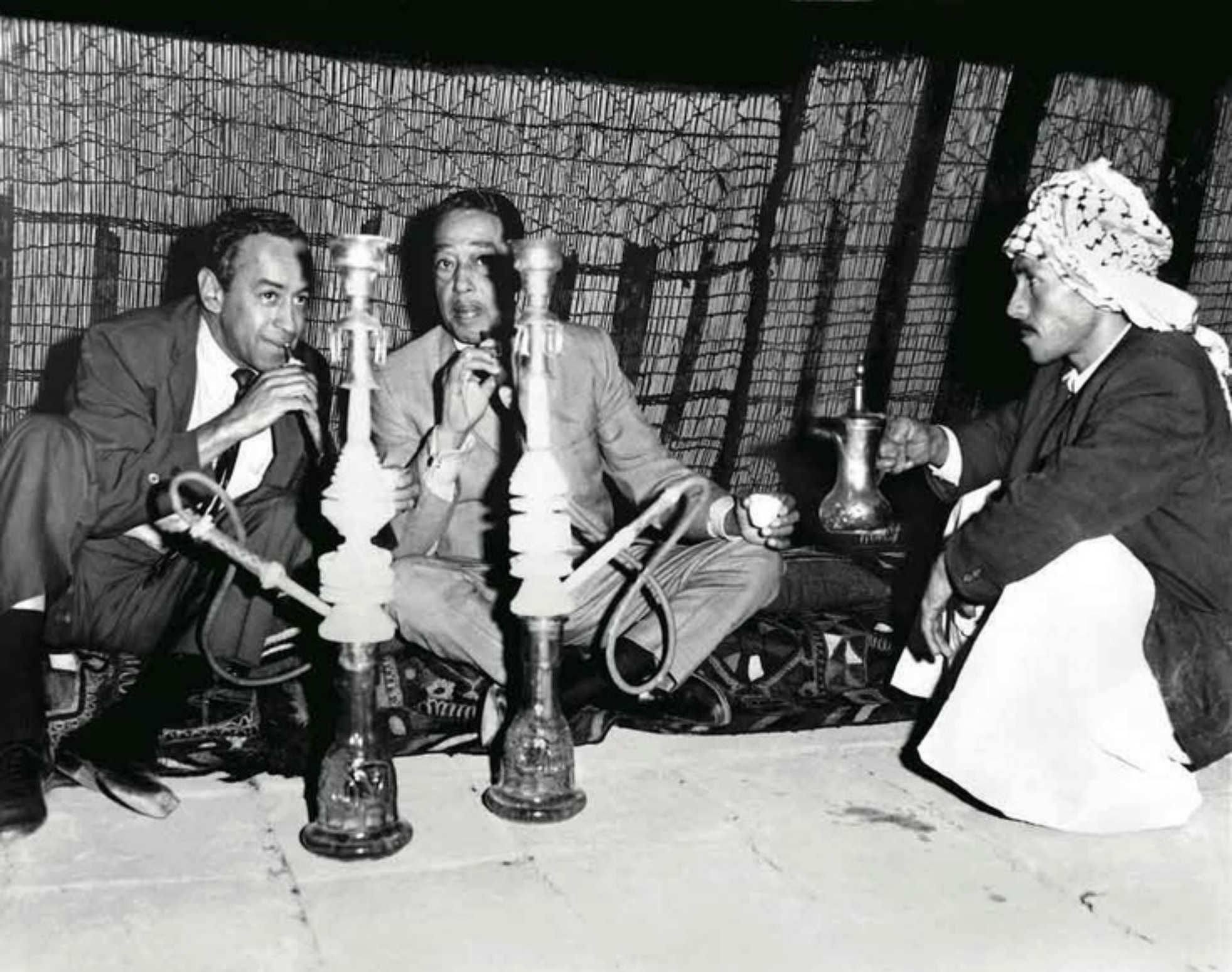
17. Duke Ellington and Paul Gonsalves 'take five' for local recreation.