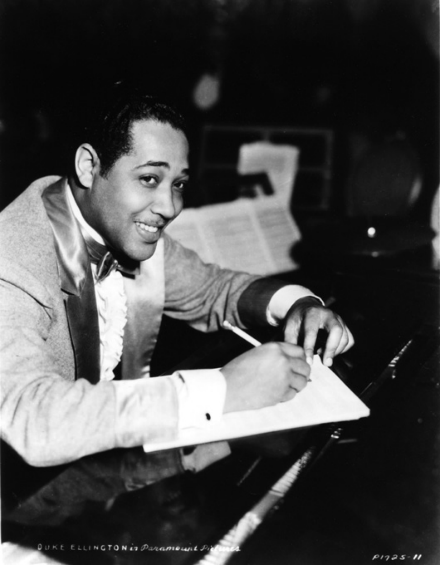
DUKE ELLINGTON in Paramount Pictures